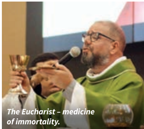
The Eucharist – medicine of immortality.