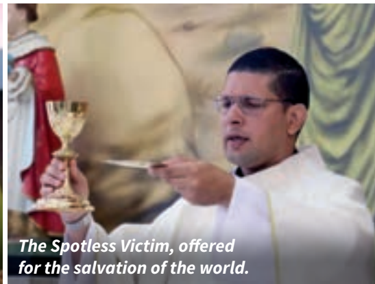
The Spotless Victim, offered for the salvation of the world.