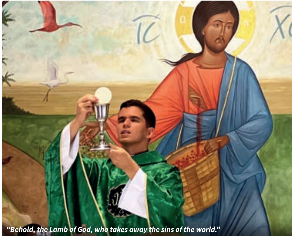
"Behold, the Lamb of God, who takes away the sins of the world."