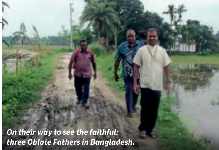
On their way to see the faithful: three Oblate Fathers in Bangladesh.

In many parts of the world where the faithful are too poor to support their shepherds, our benefactors' Mass stipends are absolutely vital. Not least in southern Asia.