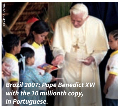
Brazil 2007: Pope Benedict XVI with the 10 millionth copy, in Portuguese.

It is important that the children do not encounter the word of God as something foreign, but as something familiar, in their own language, as a voice that speaks directly to their hearts.