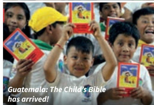
Guatemala: The Child's Bible has arrived!