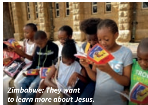
Zimbabwe: They want to learn more about Jesus.

Many children have been known to press this little red book to their hearts and kiss it when they receive it. Some of them have never seen a book before, and many would scarcely have dared to dream they would ever own one. The brightly coloured illustrations immediately appeal to them, and there is also an accompanying poster series that can be used for teaching purposes. Together, they are a simple but effective way of conveying the Gospel message to children.