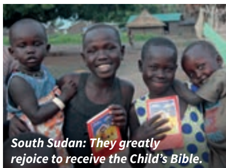
South Sudan: They greatly rejoice to receive the Child's Bible.