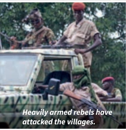
Heavily armed rebels have attacked the villages.

One village, after an attack. Below, an unexploded grenade.