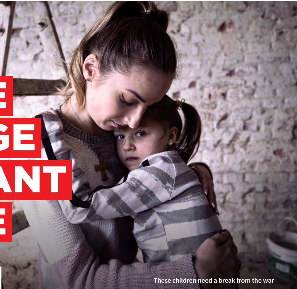
These children need a break from the war